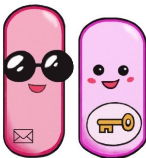
Figure 1: The CryptoGERM

1. Germinate the cryptoGERM. Therefore add 100 \mu l LB in the tube labeled cryptoGERM and vortex. Take 50 \mu l and plate the cryptoGERM on an LB agar with 150 \mu g/ml spectinomycin, if you do not have this antibiotic LB agar without should also be fine. Incubate the plate overnight at 37°C and fingers crossed for colonies.